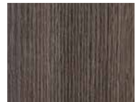
River Rock (LM67)