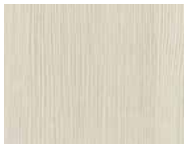
Sea Salt (LK84)