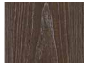
Lounge Brown* (SO28)