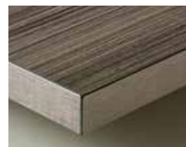
Pewter edgeband available with all colors