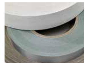
Rolls of edgeband and sheets of end skin material are also available