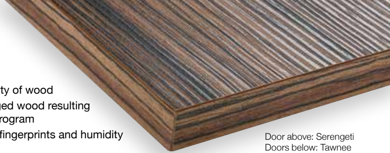
Door above: Serengeti Doors below: Tawnee