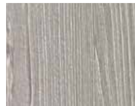
French Grey* (SO27)