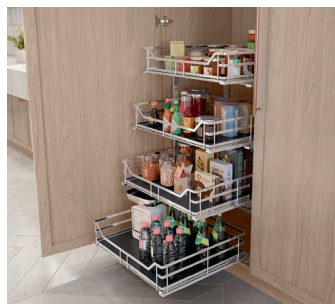
Metal Pull-Out Baskets