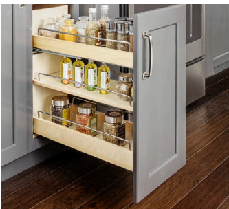
Under Drawer Base Pull-Out