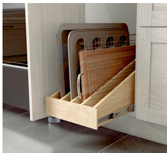
Base Tray Roll-Out