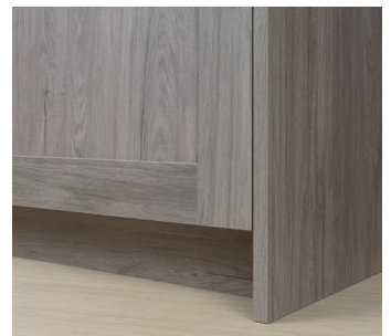
Finished Side Panel