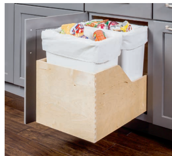
Trash Can Pull-Out