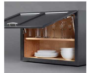
AVENTOS HK Lift Hardware