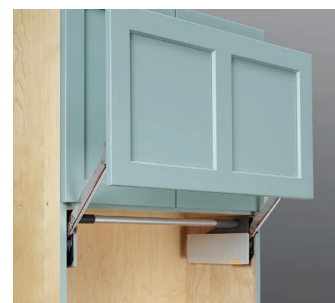
AVENTOS HL Lift Hardware