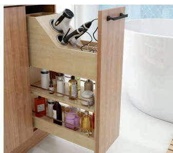
Vanity Speciality Storage