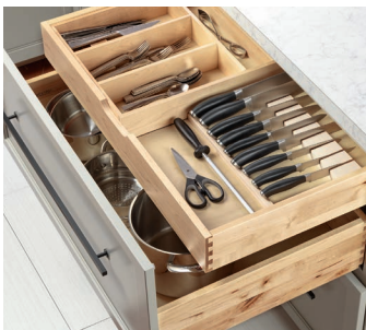
Multi-Level Drawer Storage