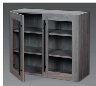
Matching Case Color