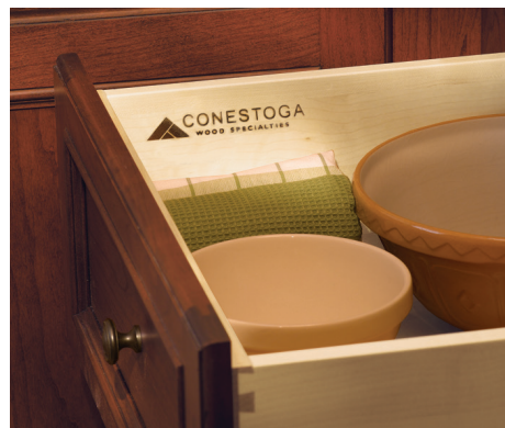
Private Label Logo