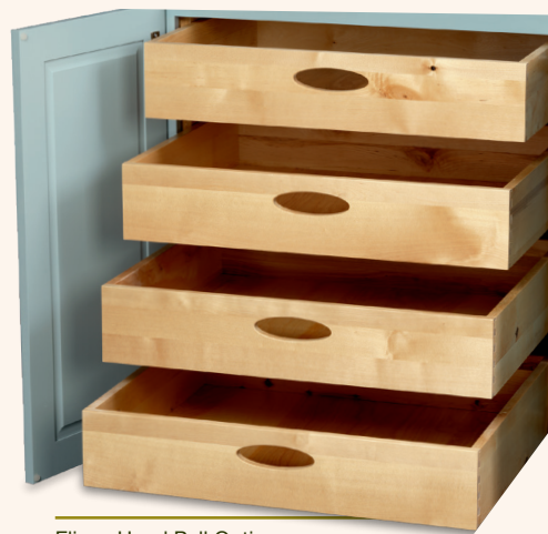
Eclipse Hand Pull Option