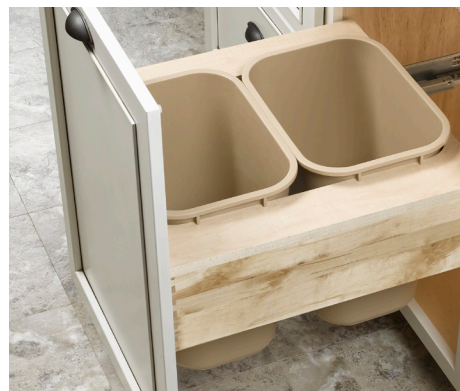
Trash Can Pull-Out