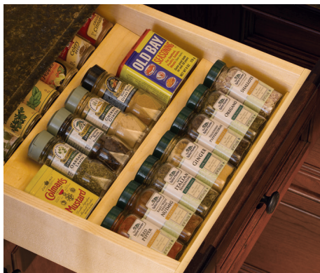
Spice Tray Insert