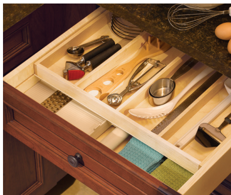
Sliding Cutlery Divider