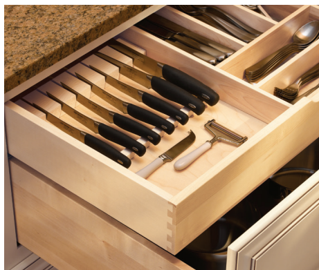
Knife Block Insert